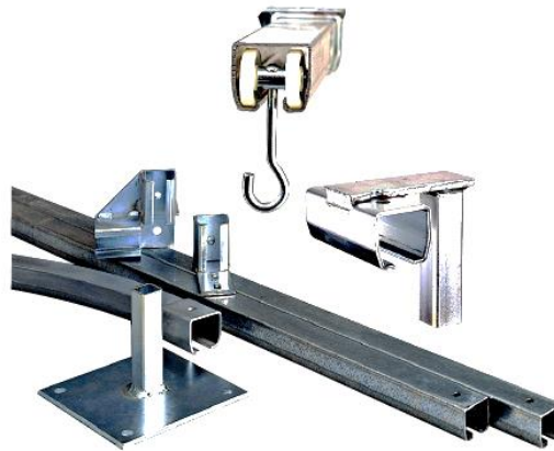
TRACK & HARDWARE